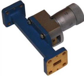
Note: The photo is for illustration purposes only. Please refer to outline drawing